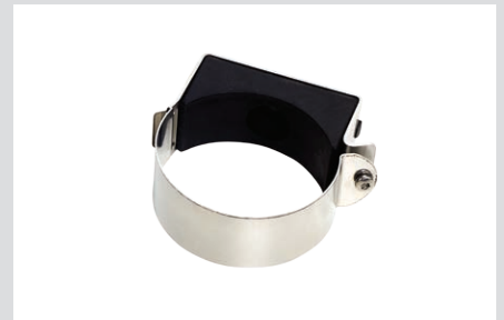
Stainless steel clamp